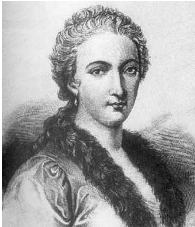
Maria Agnesi (1718-1779)

μ μ μ μ . μ (Maria Agnesi) . μ μ , , μ μ μ μ μ , , μ .