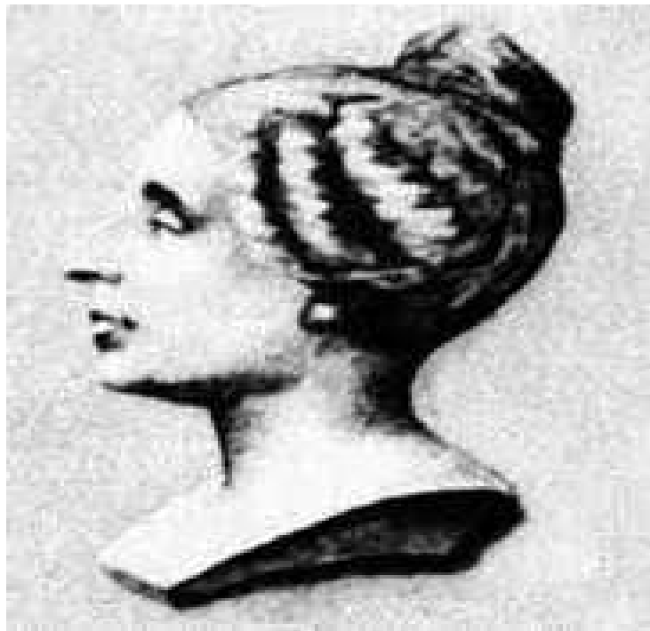
Sophie Germain/ : https://mathshistory.st

. : μ μ . , μ , μ μ μ . μ , μ , μ μ μ μ , , μ μ μ μ μ , . μ (Petrovich, 1999).