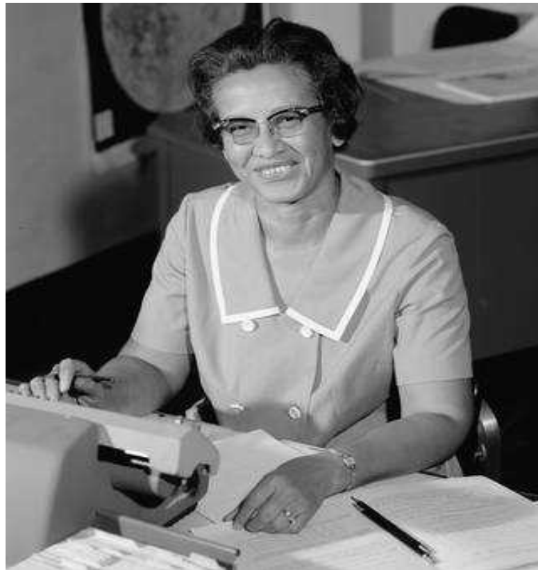
NASA research mathematician Katherine Johnson is photographed at her desk at Langley Research Center in 1966.