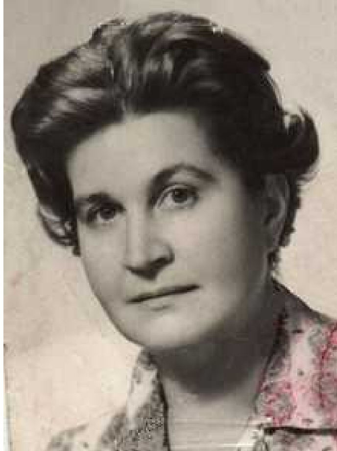
Helena Rasiowa