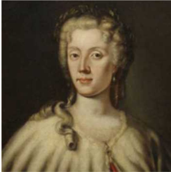
Portrait of Laura Bassi at the University of Bologna

1738 , μ , μ 12 , 5 μ μ μ μ μ μ μ , μ μ . μ μ μ μ μ μ (1.200 ) . μ , μ μ μ , ( , 1988). 28 . μ