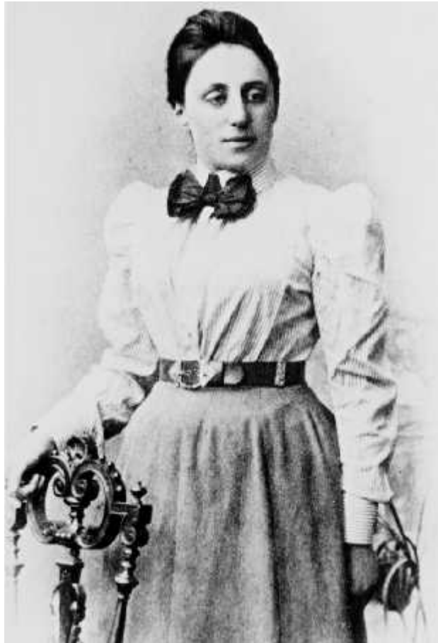
Emmy Noether c.1910

1918 Noether \mu \mu \mu \mu \mu \mu \mu\mu . \mu Noether - , \mu \mu \mu - \mu ( , \mu , \mu , . . ) \mu \mu \mu\mu . \mu \mu Noether, \mu , , \mu \mu . , \mu \mu \mu